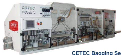
CETEC Bagging Sealer

Recommended as Best Available Technique by IPPC/EPA. They are particularly suitable for pet-food, fish feed and food industries . The non-thermal plasma systems are very low maintenance and operating costs with efficiencies of 80 – 99% . They produce no waste or by products and need no consumables.