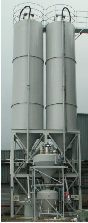
Twin Silo, weigh out & pneumatic conveying system - SCADA Control