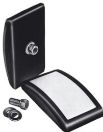
MATERIAL FLOW AIDS