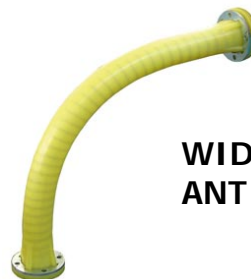
WIDE RADIUS ANTI-WEAR BENDS