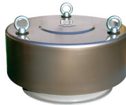
PRESSURE RELIEF VALVES (Including 355mm O/D)