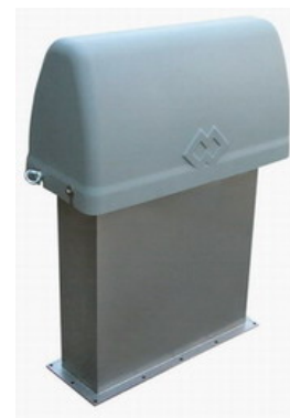
HOPPER VENTING FILTERS