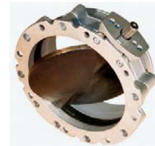
BUTTERFLY VALVES (Including actuators)