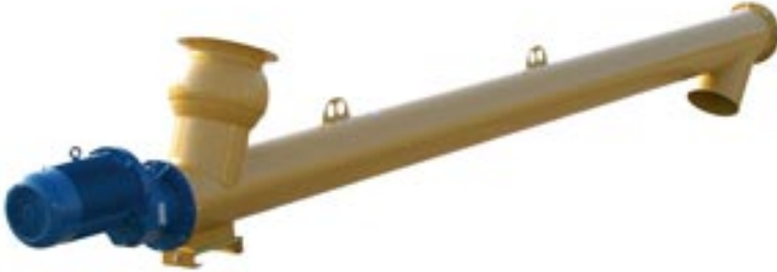
SCREW CONVEYORS (Available ex-stock, for next day delivery - 219 & 273 mm O/D, range – 7 to 12 metres lengths)