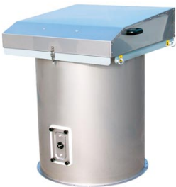
SILOTOP FILTERS 24M3 Filter area